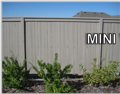
MINI WINDS or MINI ESTATES FENCING STYLE

Sherwin Williams Stain (TMMA Preferred Manufacture)