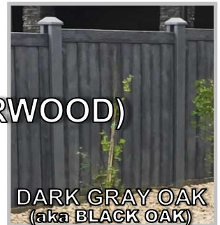
DARK GRAY OAK (aka BLACK OAK)