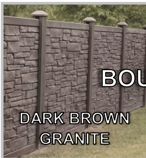
DARK BROWN GRANITE